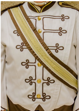
Jacket - Front