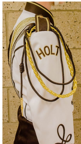
Jacket - Side w/ Cords